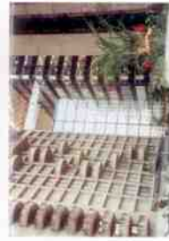
Plaza of the Americas, Dallas, Texas